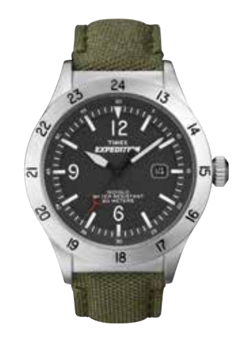
T49880 • $129