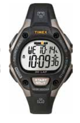
T5E961 • $119