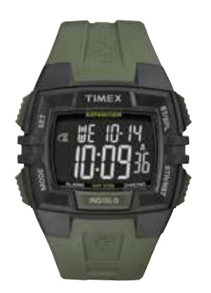
T49903 • $129