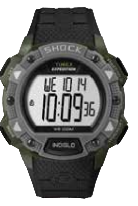
T49897 • $139