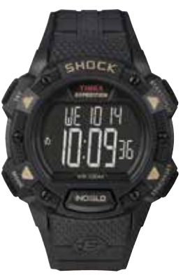
T49896 • $139