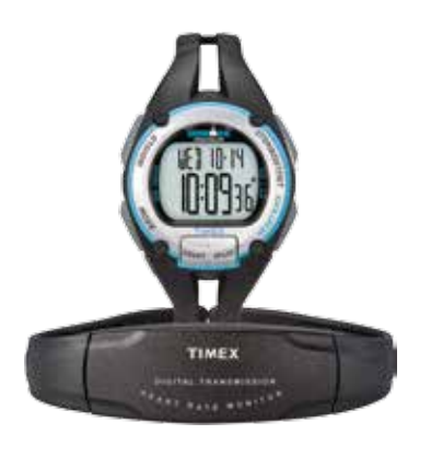
T5K214 • $169