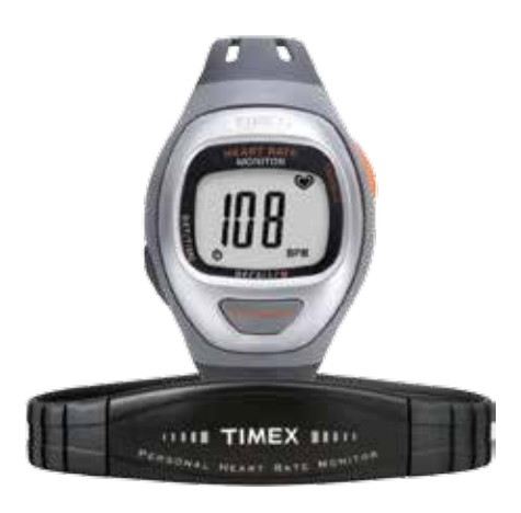
T5G941 • $99