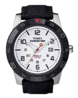
T49863 • $99