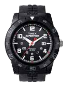
T49831 • $119