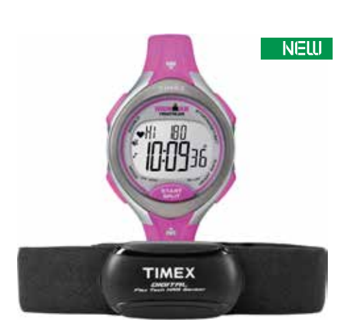
T5K722 • $169