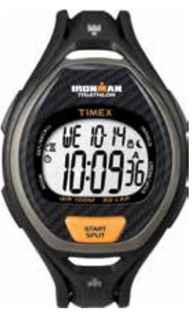
T5K335 • $129