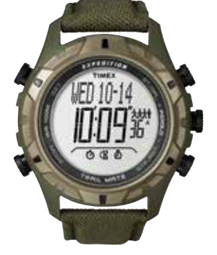
T49846 • $129