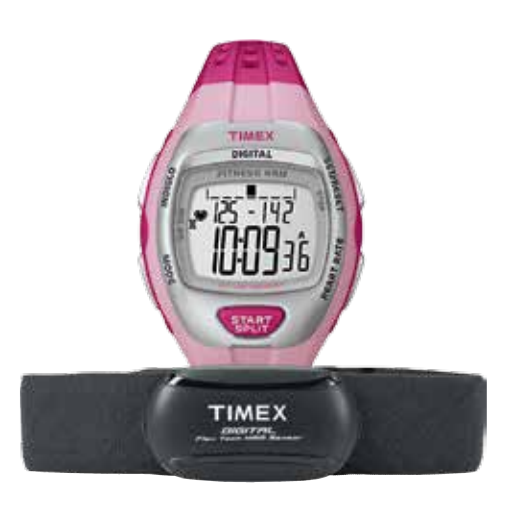
T5K628 • $149