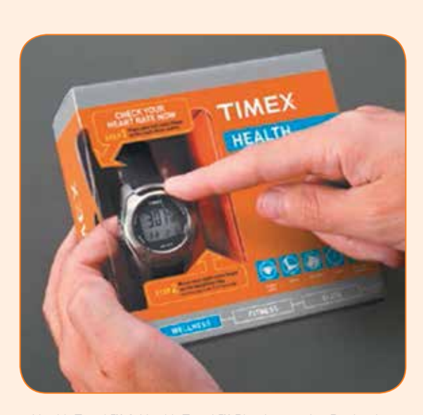
Health Touch™ & Health Touch™ Plus Interactive Packaging