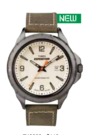
T49909 • $119