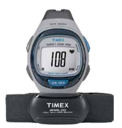
T5K541 • $119