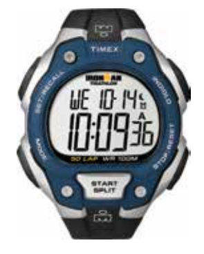
T5K496 • $129