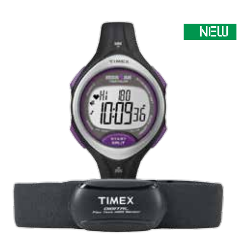
T5K723 • $169