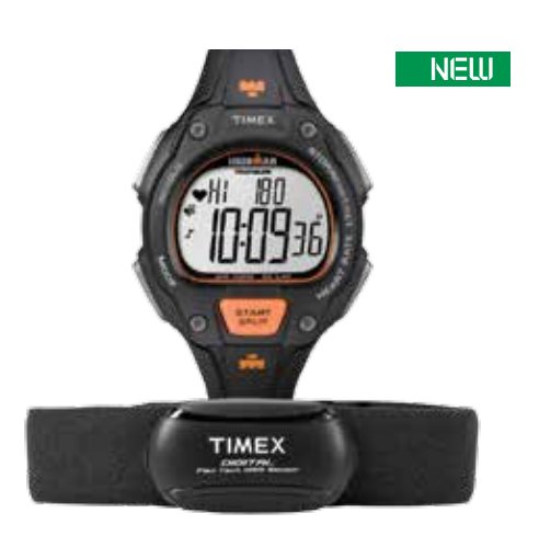
T5K720 • $169