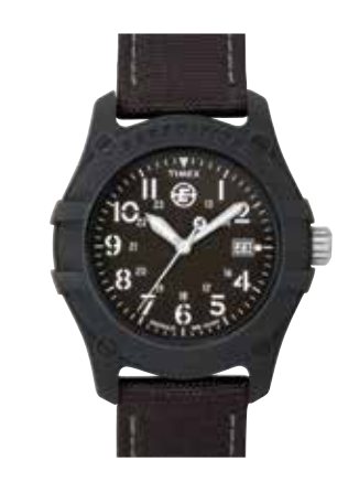
T49689 • $99